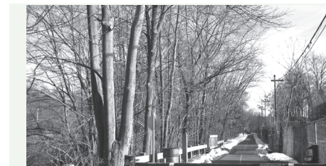
Existing multi-use trail at Central Avenue

An option for a trail staying entirely on existing roads, maximizing conservation and limiting intrusions into natural areas will also be presented. The route follows Eliot and River Streets from Central Avenue to Mattapan Square and then follows Truman Parkway to Neponset Valley Parkway and Paul's Bridge. This route provides a much more "urban" experience and greatly limits opportunities for viewing the river.